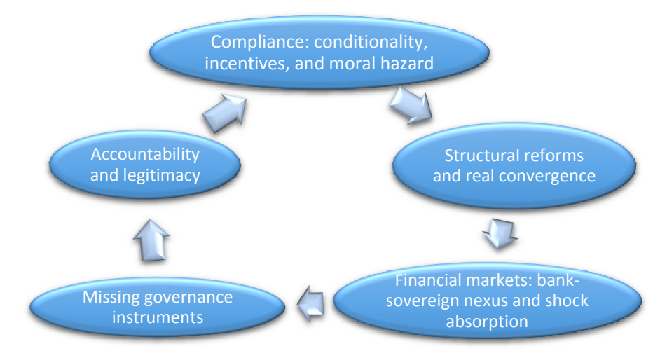
Figure 7. Directions to take actions for strengthened EMU