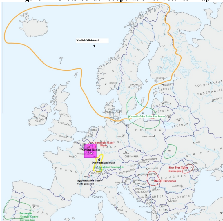
Figure 1 – Cross-border cooperation structures' map